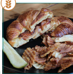
Fig & Onion Rustic Panini

Sweet & Smoky! A Flaky, Buttery Croissant topped w/ crispy Bacon, Cinnamon Sugar Apples, Lowville Maple Cheddar Cheese & a drizzle of Maple Syrup, then toasted to perfection.